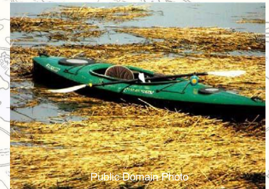
Public Domain Photo